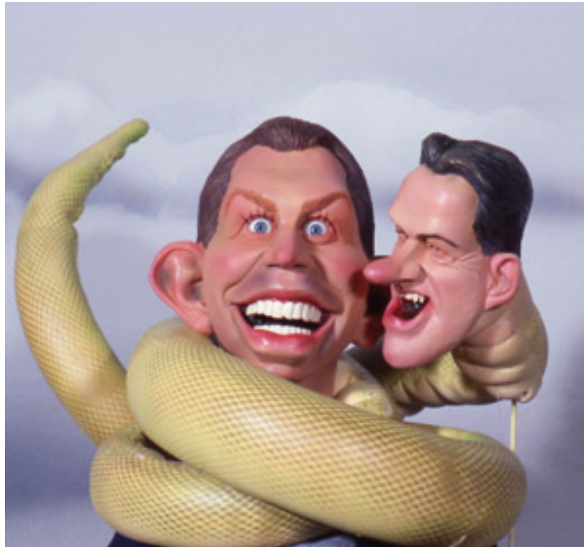
Tony Blair and Peter Mandelson

3. b. When we come to the European Union, it seemed that there would be something genuinely new when New Labour came to power in 1997. Blair appeared to be seriously in favour of a change of policy, and had close colleagues who were fervent pro-EU politicians.