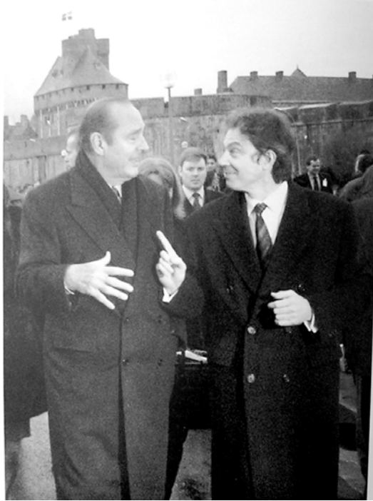
St Malo, December 1998

3. c. The third of Churchill's circles was the US. I do not have the time to take you through where the US fits into UK foreign policy making. Suffice to say that Blair, like many prime ministers before him, knows that, if he has to make the choice, he will cleave to American power. (Macmillan after Suez. Exceptions: Wilson over Vietnam, and Heath, 70-74.) This has been reinforced by the Americans themselves (although they are normally much less interested in the 'Special Relationship' with the UK than we are: take, for example, Bush's remarks about there being no quid pro quo between the UK's role in Iraq and any climate change deal at Gleneagles). Clinton told Blair after the US Republican victory that UK had to stay close to US, despite the ideological differences between Bush and Blair. Blair has adhered to this advice. This is doubly ironic, as, the early 1990s, even those in the UK were beginning to argue that the days of the old Special Relationship were dead. However, at the Lord Mayor's banquet in 1997, Blair trumpeted the UK as the bridge between the US and Europe: 'When Britain and America work together. . . there is little we cannot achieve.' or as he later put it, the 'price of influence is that we do not leave the US to face the tricky issues on their own', a phrase that could only too easily have been that of Macmillan.