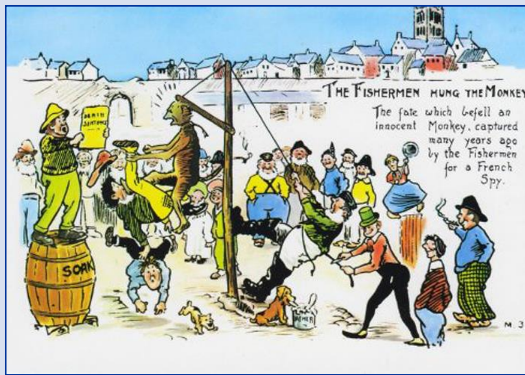
Source: "The Hartlepool Monkey, Who hung the monkey?" This is Hartlepool , n.p. Web. 28 May 2017 < http://www.thisishartlepool.co.uk/history/thehartlepoolmonkey.asp >

Believe the legend or not - Hartlepool citizens have always been suspicious of newcomers.