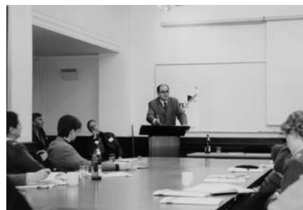
Christian Schmidt MdB