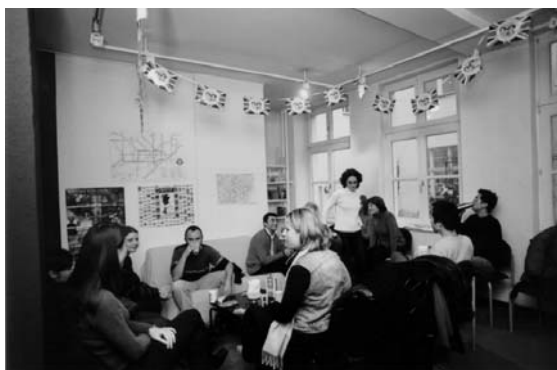
The students enjoying themselves in the common room

On the ground floor of the Jägerstraße the Centre for British Studies has a common room with sofas and armchairs for the students where they can enjoy a cup of tea during the breaks between the lectures, meet after class for group work and discussions or simply relax and have a chat.