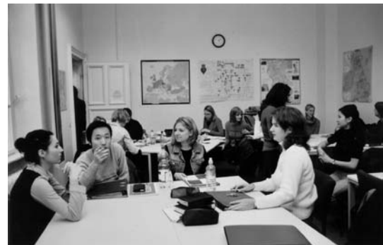
M.B.S. class 2002

Our Master in British Studies degree course is now so well established that we were able to pick our fourth class from a large number of applicants from nearly 30 different countries. Thanks to a renewed grant from the Mercator Foundation we were able to offer 15 places with a grants scheme. We also managed to supplement the Mercator donation with DAAD matching funds from the International Office of the university, a solution which allowed us to take the best of our applicants irrespective of their private financial backing. We were also successful in our applications to the DAAD for grants supporting our German students during their placements in Britain.